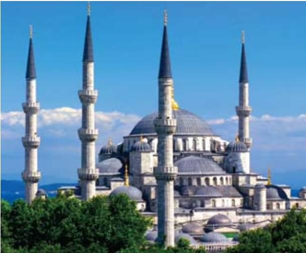
Peloponnese coastline (top) Blue Mosque Istanbul (above)