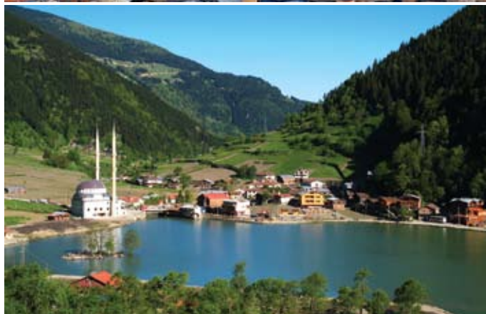
(top) Stromboli; Nauplion; Prinsendam at Istanbul; Uzungol Lake, Turkey (above)

To book a place on the cruise please request a booking form from