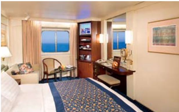
(top) Twin outside on the Atlantic Deck, (above) twin outside on the Main Deck