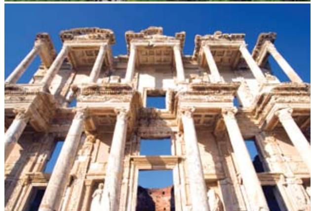
(Top) Balaclava Harbour; Sumela Monastery; Ephesus (above)