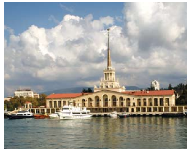
The Seaport at Sochi

Start the next day with a lecture by Bill Bynum on ‘Malaria in the Eastern Mediterranean and the Black Sea’, followed by the opportunity for all to participate in an Open Forum. Spend the rest of the day at leisure in Batumi, a Georgian port town and resort with a Turkish flavour in a beautiful lush subtropical setting among citrus groves, tea plantations and mountains rising up from the sea. Suitably refreshed, cruise onto the bustling, historic port of Trabzon in Turkey the next day. Drive up to the Byzantine Greek Orthodox Sumela Monastery, an atmospheric building which clings to a sheer rock wall high above evergreen forests and a rushing