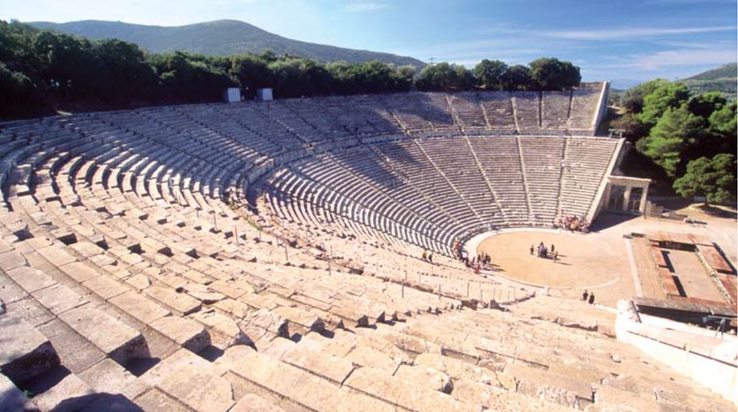
The Amphitheatre at Epidaurus