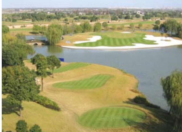
Silport Golf Club, Shanghai