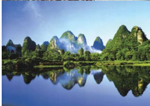
(Top) Terracotta Warriors, Xian, (above) Li River, Guilin