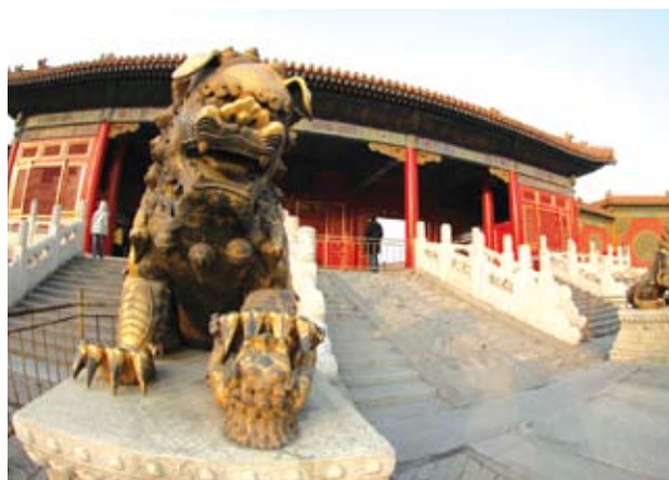
"Walk through the The Forbidden City", Beijing