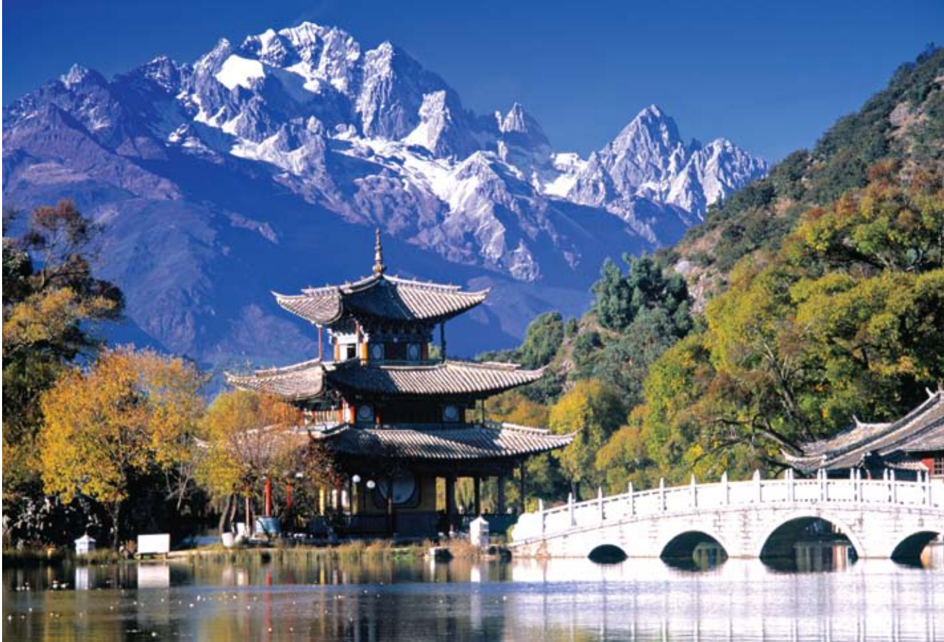
Jade Dragon Snow Mountain