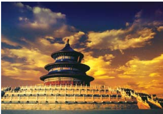
The Temple of Heaven, Beijing

Onward to Beijing, China's imperial capital city. Beijing contains some of China's greatest cultural treasures, as well as being superb for shopping, entertainment and dining. Your orientation tour will take you to Tiananmen Square and through the magnificent Forbidden City.